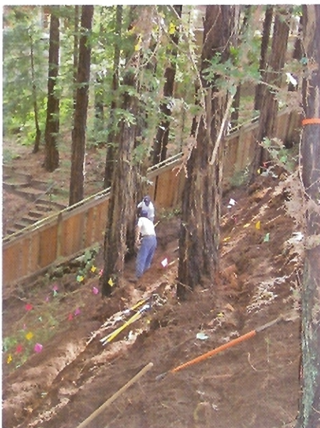
A steep slope installation in California — 65% slope.

Design guidelines are available directly from Geoflow and at www.geoflow.com .