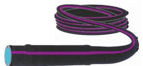
Look for the anti-bacterial turquoise lining.

Bacterial growth — Geoflow's WASTEFLOW dripline is coated inside with the anti-bacterial, Ultra-Fresh ® to inhibit bacterial growth on the walls of the tube and in the emitters. Ultra-Fresh has been found to be effective in preventing slime build-up inside the tube, even with effluent that has very high BOD.