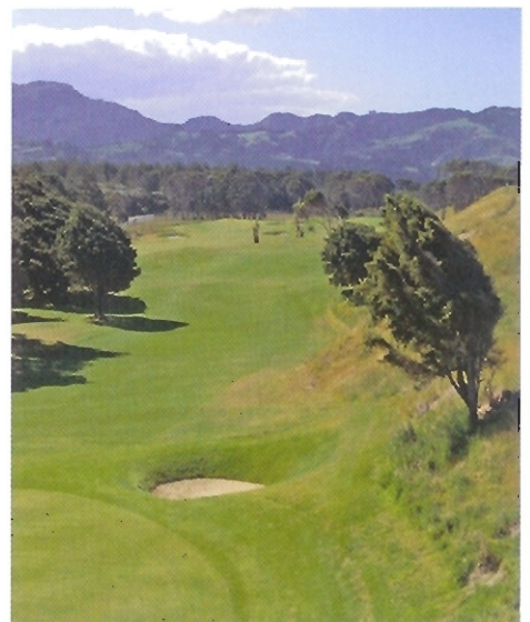
Omaha Beach Golf Course, N.Z.