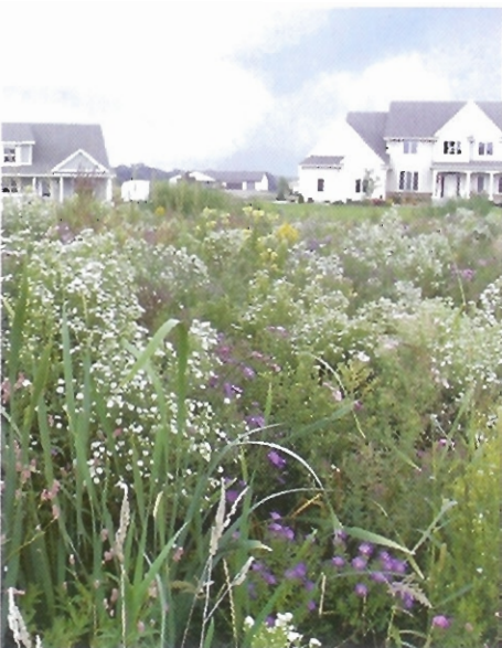
Subdivision in Minnesota.

Geoflow drip dispersal is recommended for commercial, municipal, industrial, residential and agricultural applications.