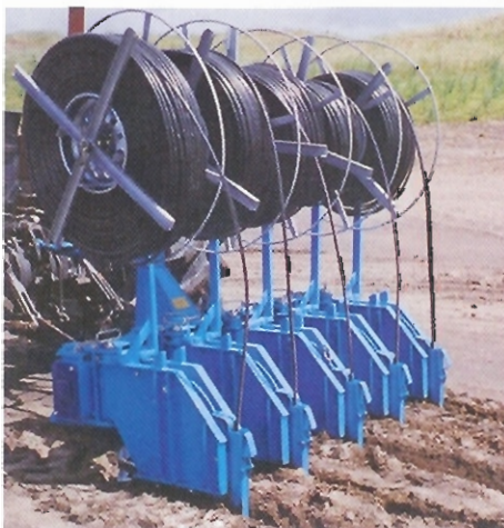
Plow single or multiple driplines at a time.

Subsurface drip also solves the problem of small or odd-shaped areas, such as property edges and around buildings and other structures. The flexible tubing can easily be fit to uneven spaces. Since the wetted area is within close proximity of each emitter, run-off problems are easily eliminated.