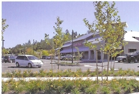
Higgins Corner, Nevada County, CA.